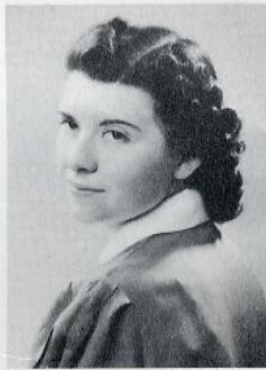
HENRIETTA LEONARD GENERAL