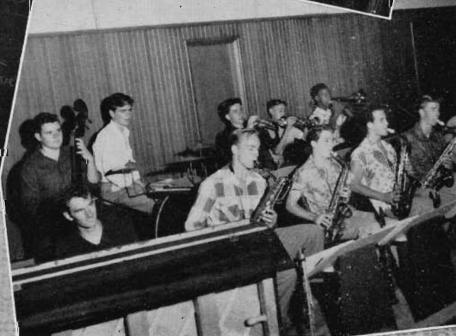
Top—A lucky winner at the Sophomore Reception. Center left—Interesting; Hmmm! Center right—Could we interest you in a Prospector? Bottom left—What happened? Did you already read it? Bottom right—"Music Maestro, Please."