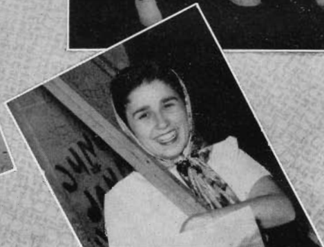
Top left—Boring show? Top right—Say buddy, can you spare a dime? Center left—A LOWly actress. Center—What'cha lookin' at? Center right—The Big Three. Bottom left—Two guys and a gal. Bottom right—All she needs is a halo.