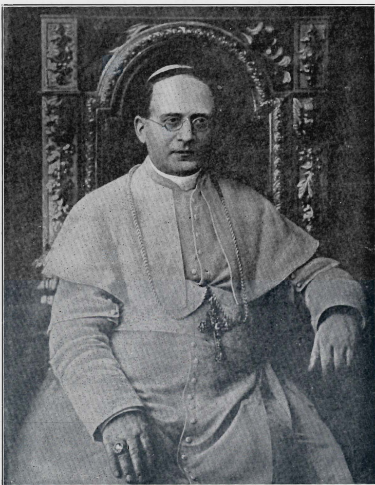
Our Holy Father, Pius XI