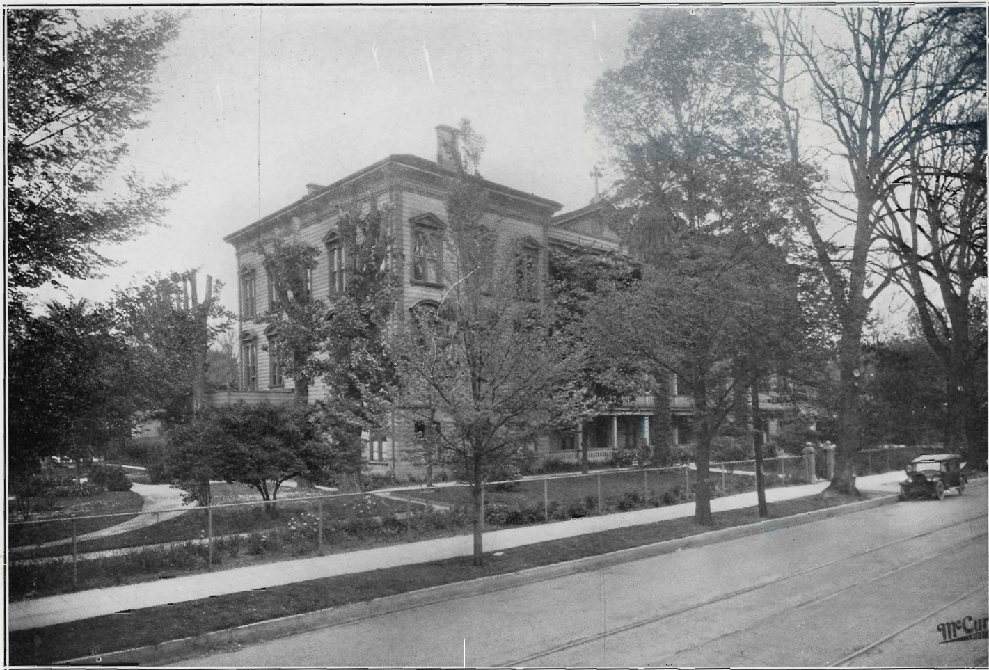
The Saint Joseph Academy