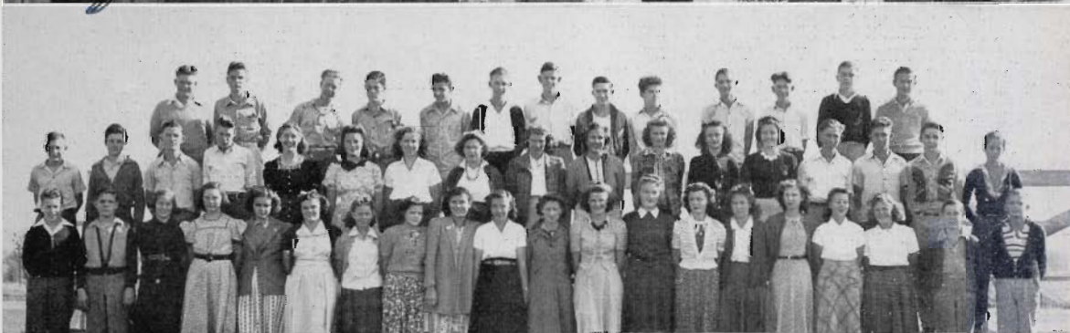
Uda Top Picture