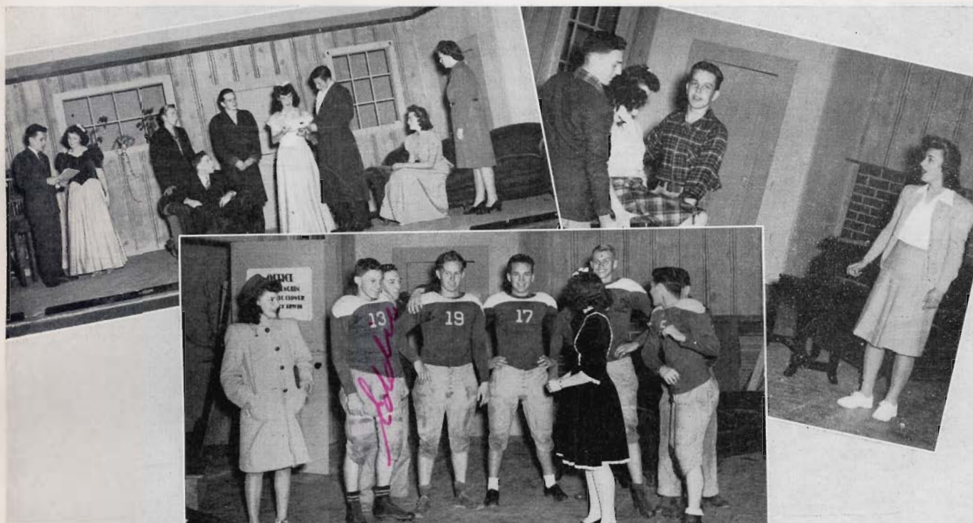
TOP RIGHT PICTURE