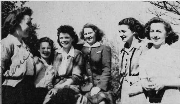
STAGECRAFT CLUB OFFICERS

One of the highlights of the year was our banquet at which time the third period Public Speaking class gave after-dinner speeches. The patriotic theme was carried out very effectively even to the place-cards which were defense stamp books. We feel that our club has been very successful in supplying a source of willing and capable workers to do the work "behind the scenes" in order that the plays at San Juan may be bigger and better.