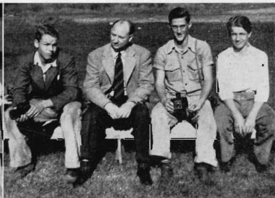
PHOTOGRAPHY CLUB OFFICERS