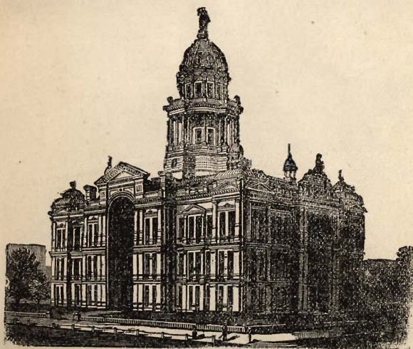
COUNTY COURT HOUSE, STOCKTON.

Giving Name, Occupation and Residence of all adult persons in the County,